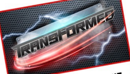
WE ARE LEARNING ABOUT JESUS'S LIFE!