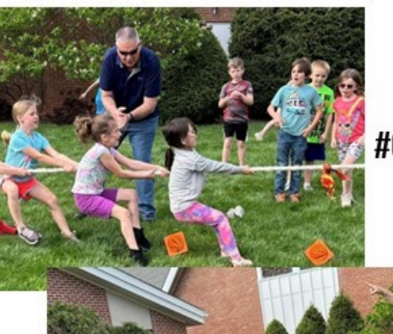
We appreciate all of our #CornerstoneKids Min Volunteers!!